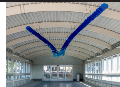
Sky Bridge (2014), Seth Palmiter