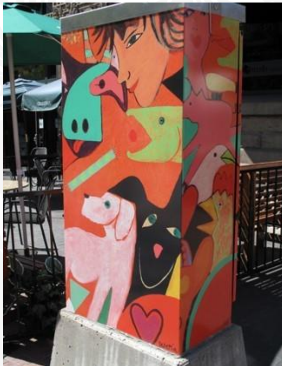
White Dog with Earcap Leads Parade (2010) by Tarmo Watia

The City of Boise's Department of Arts & History invites artists to apply for the opportunity to create new artwork for the 2025 Traffic Box Art Program. Selected artists will be paid $1,000 to create or supply original artwork to be digitized and fabricated into a vinyl wrap. Artists may use original, existing, unpublished artwork or create new, original artwork which could consist of illustration, painting, digital images, textiles, mosaic, photography, photographs of original artwork and more.